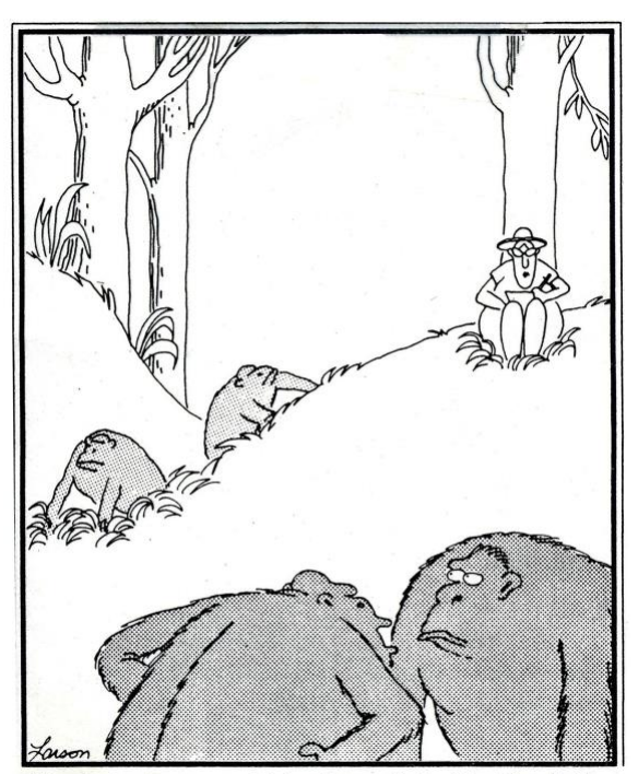
'Don't shush me—and I don't care if she IS writing in her little notebook; just tell me where you were last night!" Gary Larson, The Far Side

Course Description & Objectives: A primary goal is to understand and apply basic principles and concepts in the biological sciences. Students will learn how to explain and assess the relationship among assumptions, method, evidence, arguments, and theory in scientific analysis. We will achieve these aims through a question-oriented survey of the world's living primates in which students will: (1) acquire a broad knowledge of the biology of primates, i.e., their diverse anatomy, behavior, ecology, and mental worlds; (2) gain appreciation of the fact that so many features of living humans—from our bodies to our social behavior to our thinking—cannot be fully understood without comparative reference to nonhuman primates; (3) discover some of the many unanswered questions currently challenging the people who study primates; and (4) develop some understanding for how we go about answering the many questions about why the myriad primate patterns we see exist as they do.