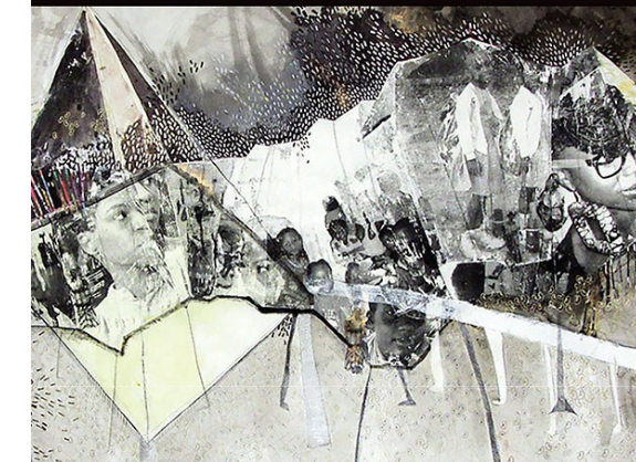
Cover Image: Progressive Dystopia: Abolition, Antiblackness, and Schooling in San Francisco , Duke University Press 2019

Monday, December 09, 2019 3:55-5:15pm RAB-001